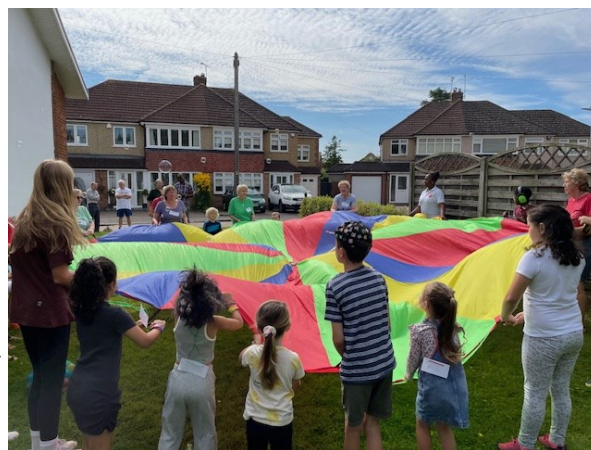
Holiday Club parachute fun (above) in the church garden, while below Adventure Cruise passengers face up to one of the daily challenges.

So much fun was had by everyone involved in the 2023 Holiday Club. Its title was 'Adventure Cruise'. For the week, the church hall was converted into a cruise ship with the leaders and helpers forming the crew and the children as passengers. During our daily activities we cruised the six Cs (Choice, Courage, Call, Change, Commitment, Challenge), meeting people from the Bible on the way who had had a life-changing encounter with Jesus. We presented the theme with the aid of our usual tools of song, Bible story, discussion, art, craft and games. This was augmented by a daily drama and quizzes along with prayer writing and jokes. Twenty children and five young helpers enjoyed a wonderful week of discovery, as did the adults involved with leading the groups, presentation, drama, personal testimonies, administration and providing refreshments.